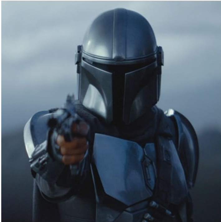
“This is the Way” - The Mandalorian