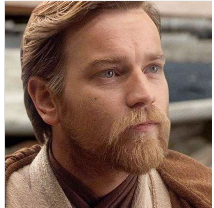
“May the force be with you” - Obi Wan