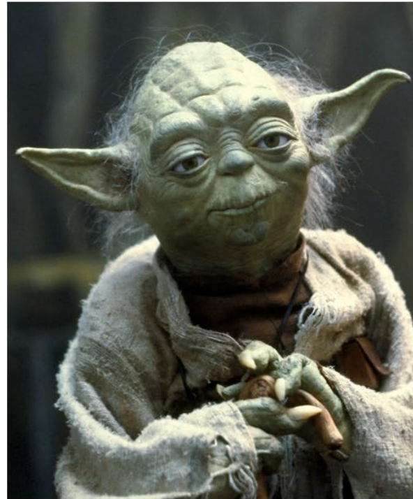
“Do or do not. There is no try” - Yoda