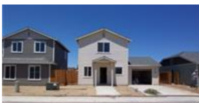
An ENERGY STAR certified home in West Modesto, CA, built in 2011 by Habitat for Humanity

ENERGY STAR certified homes are at least 10% more energy efficient than homes built to code and achieve a 20% improvement on average, while providing homeowners with better quality, performance, and comfort. EPA continues to advance its ENERGY STAR residential new construction program requirements as more rigorous building energy codes are developed and adopted by States. Learn more.