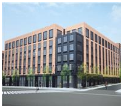
Greenpoint Landing G2 Brooklyn, NY

In 2018, EPA introduced ENERGY STAR RaterPRO, a free web and mobile app that helps third-party home energy rating companies conduct on-site diagnostic testing and inspections to verify that homes meet established ENERGY STAR program requirements. RaterPRO improves upon the program's earlier paper checklists by letting Raters capture digital photos and notes, Geotag the inspection location, and automatically sync information to the Cloud. The all-digital workflow helps rating companies deliver accurate, high-quality ratings and ensures that every ENERGY STAR certified home meets the technical specifications and energy efficiency requirements.