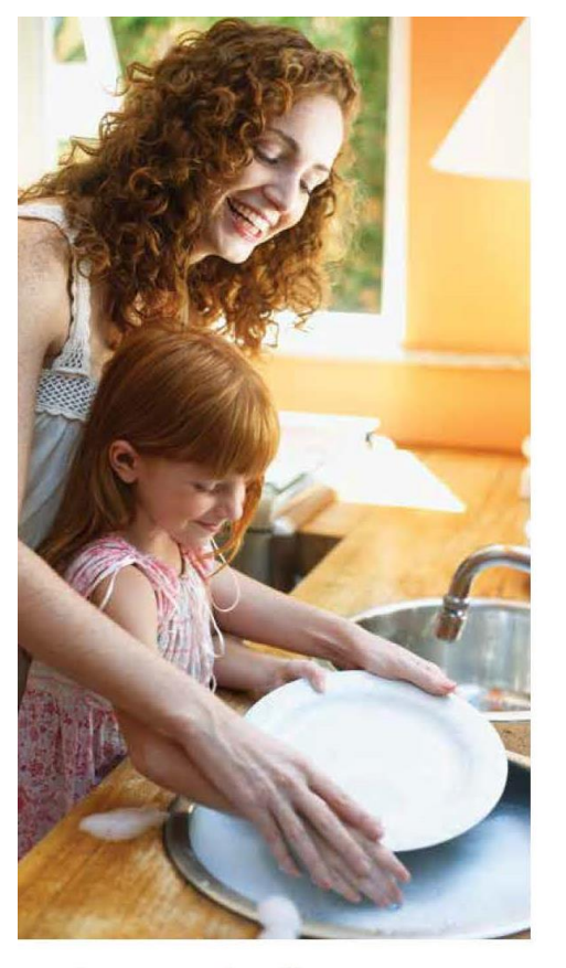
to learn more about Kenmore® water heaters, go to Kenmore.com or visit a Sears<sup>®</sup> store.