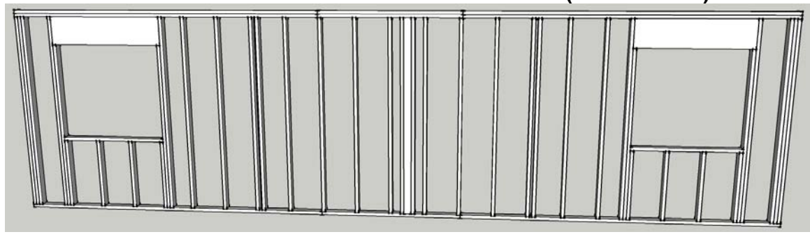
30' 2x4 16" OC Standard Wall with Two Windows (4'-1" x 3'-8.5") i,ii

The wall below has the same framing fraction as RESNET's default value for a standard wall with 16" OC framing.